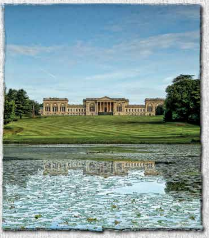
REVEALING THE HISTORICAL SIGNIFICANCE OF FOUR ICONIC GARDENS CREATED DURING FOUR VERY DIFFERENT ERAS